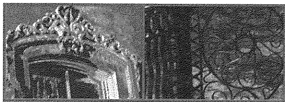
Architectural Details in Savannah