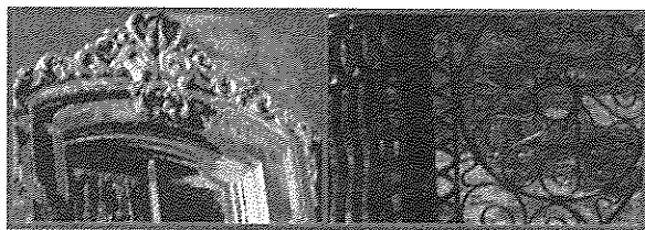
Architectural Details in Savannah