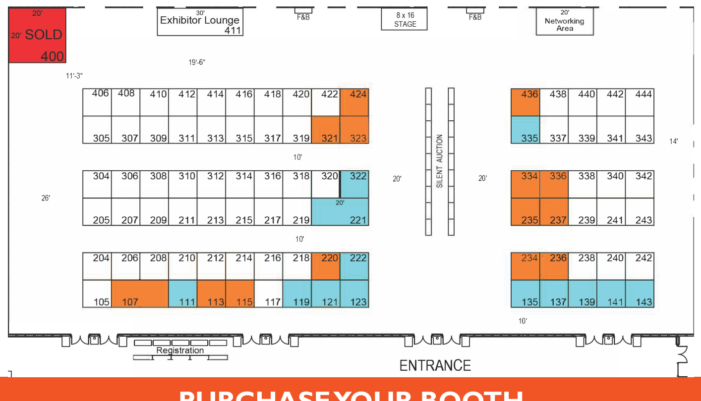
EXHIBIT HALL: OSCEOLA BALLROOM Omni Resort at ChampionsGate, ChampionsGate, FL